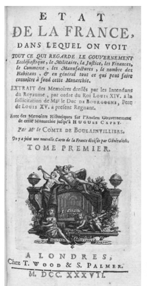
The title page of Henri de Boulainvilliers Etat de la France (London 1737).

villiers conceded that these barbarian peoples had lacked the sophisticated political wisdom of the ancient Greeks; yet, despite their unphilosophical simplicity, they had nonetheless managed to come up with a practical solution to their political needs. They required monarchs to lead them in battle, but, equally, they had been aware of the inconveniences which might ensue from unconstrained monarchical authority, and had established 'assemblées communes' to circumscribe the authority of their kings. Such, of course, had been the case of the ancient Franks. Under the ancient Frankish constitution kings had ruled with the consent of the assemblées générales of the Champ de Mars or the Champ de Mai.<sup>27</sup>